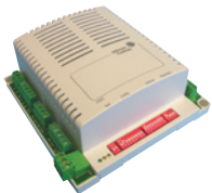
FX03 Terminal unit controller BacNET and N2 Metasys network compatible